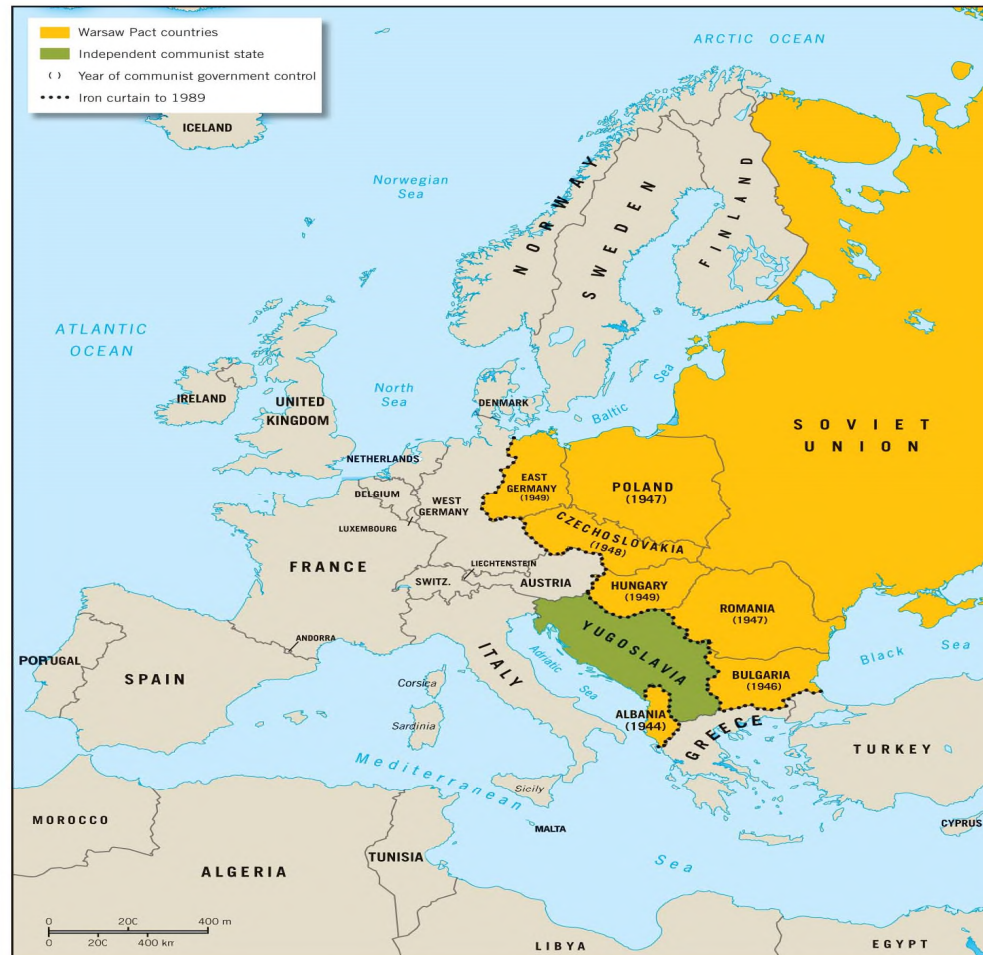
Map 2.2 Cold War Division of Europe